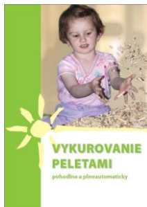
Book and brochure HEATING WITH WOOD PELLETS