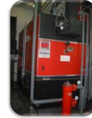
Kindergarten in the municipality of Luky