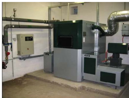
Fig. 2: Example of an old boiler before reconstruction...