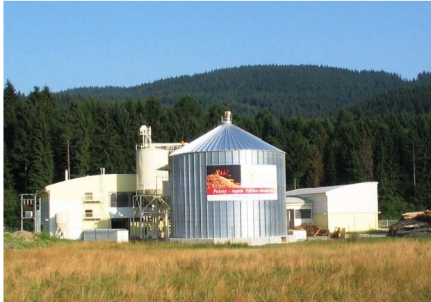
Fig.1: Pellets production plant in Kysucky Lieskovec

The new pellet plant in Kysucky Lieskovec in Zilina region is in operation since October 2004. Its production capacity reaches 12 000 tones per year using approx. 20 000 tones of wood residues. The initial investment costs for the plant construction were about 3,5 millions Euro. The technologies used are from Slovak producers besides the pellet mill, which was delivered by CPM Europe in Netherlands. The hourly production is 2 - 3 tons.